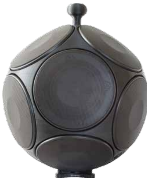
OMNI 5'' 3D