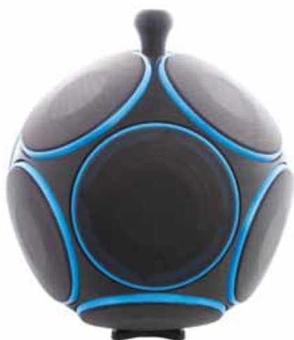
OMNI 4'' LT