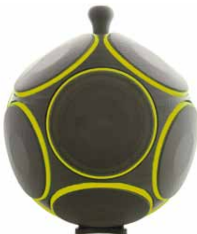
OMNI 4'' HP